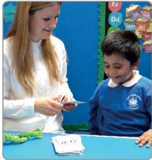
Learning the Speed Sounds in the classroom.